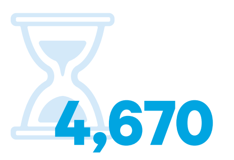
hours were spent by our chaplains in engagement within village communities

During 2022/23, we expanded chaplaincy services both at the Metlifecare village in Hillsborough and at Selwyn Village. A review of the chaplaincy model of spiritual care has recently been completed via resident focus group consultation and chaplaincy team reflection. This will assist us to meet the needs of even more residents in the provision of all-important spiritual care and support.