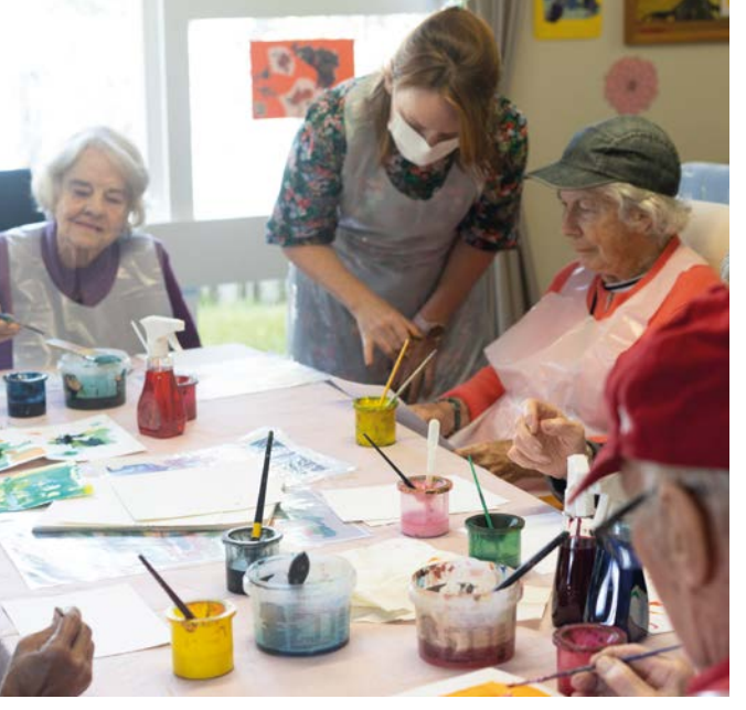
A Lavender Cottage client discusses her artwork with the Connect the Dots' art educator. An inspiring short film about the programme is available at selwynfoundation . org.nz/selwyn-village/residential-care .

With the relaxation of COVID-19 restrictions, our clients were once again able to enjoy dance therapy sessions as well as in-person music therapy workshops delivered by the Raukatauri Music Therapy Centre. A new programme for 2022/23 was the specially-designed 'Make Moments' creative art workshops run in partnership with art educators from Connect the Dots charitable trust.