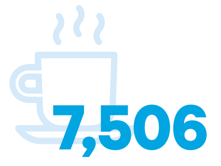
meaningful connections with our chaplains during 2022/23