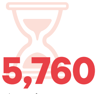
hours of engagement with guests