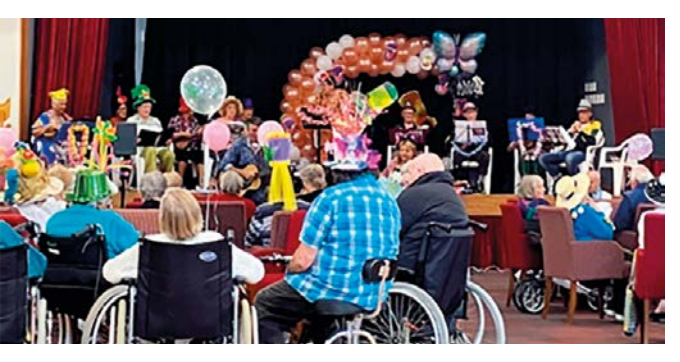
The Mad Hatters Tea Party in April 2023 was the first integrated village event held for both independent living and care residents since the start of the COVID-19 restrictions.

We implemented a number of key improvement initiatives over the year to enhance our care delivery, promote best practice and improve our resident and family experience. This included strengthening our nursing and caregiving teams, and enriching our staff education and training programmes together with putting focus on making sure our new team members are welcomed and can become effective in their roles quickly. In response to the introduction in 2022 of the Ministry of Health's Ngā Paerewa Health and Disability Services Standard, we adopted the 'MOA' electronic quality management system. We also expanded our resident-centred model of care (already in place at the Ivan Ward Centre) across our Sarah Selwyn and Kerridge care homes, thus empowering residents to have greater independence and decision-making over their care and daily routines.