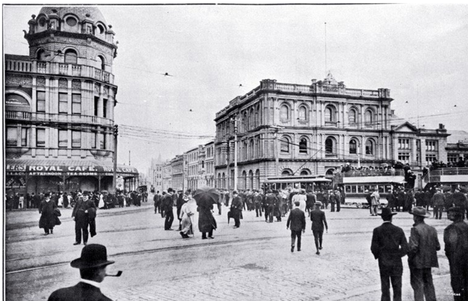
Easter Monday in Cathedral Square, Christchurch (1907).

The evolution of the Easter break turning into just that – a break – happened in New Zealand before the same occurred in the motherland. New Zealand was first to introduce Easter Monday as a day off work, which was a result of the Easter holiday being slowly adopted by New