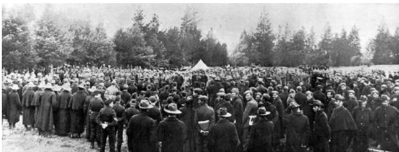
The Easter manoeuvres of the Canterbury volunteers at the Sheffield Camp. 31 Mar. 1907