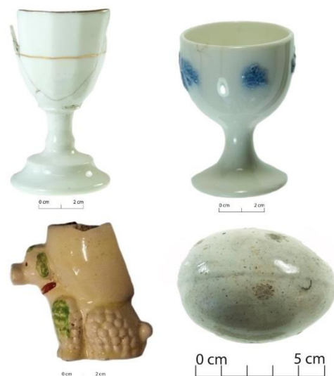
Egg cups and an undecorated ceramic egg.