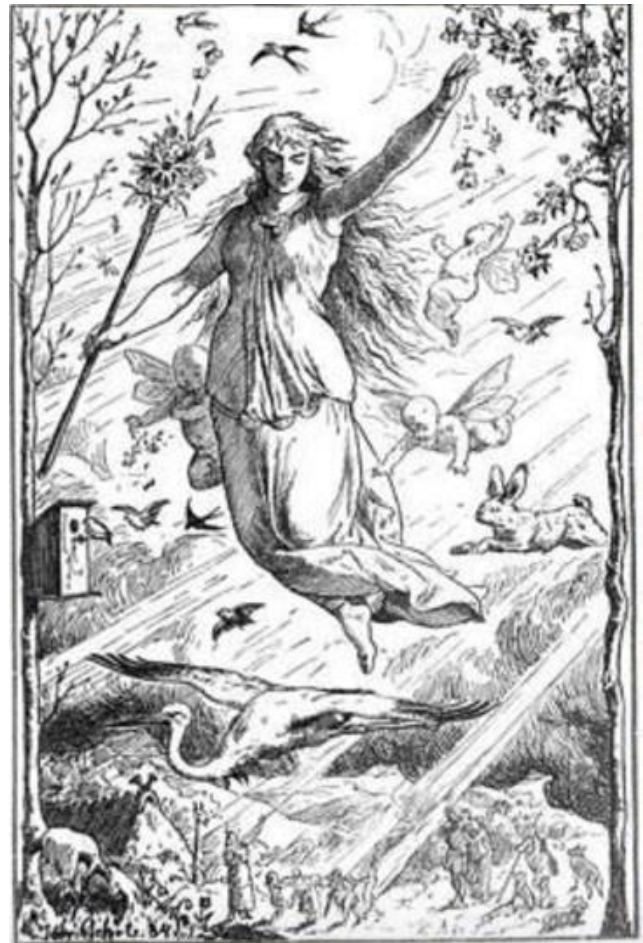
Eastre – pagan goddess of spring.

Unfortunately, we have never found any evidence of these festive eggs on a Christchurch archaeological site. The closest things we’ve found are decorated egg cups, which were commonly used as part of a breakfast table setting. Less commonly, we also come across undecorated ceramic eggs – thought to have been used in chicken coops to encourage hens to lay their eggs in a common place.