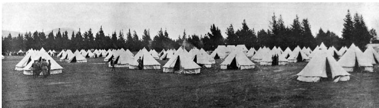
A view of the camp of the Blue Force at Sheffield.

Demonstrations were held by the Police each Easter at a few locations around the country. The weekend schedule consisted of drills on Thursday and Good Friday, a parade on Sunday, and the celebrations culminated on Easter Monday with a major field exercise or sham-fight (Clarke 2007: 157). But all the fun wasn't just to be had by the men-at-arms, many spectators attended, and some camps included contests, bands and balls (Clarke 2007: 158). Nearby hotels also made roaring trades in the evening from associated celebrating (Clarke 2007: 159).