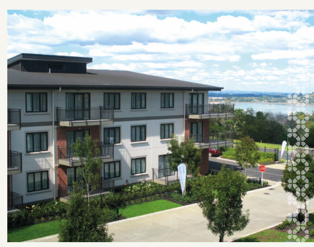
The Gowing apartments opened in 2013 at Selwyn Heights.

The statement of cash flows highlights improved cash performance for the year, with the bank balance increasing by $16.3m to $38.6m. This was largely driven by independent living unit sales receipts of $57.4m from the settlement of 82 new units and 45 resales. This was a significant increase from the 92 total settlements in 2012.